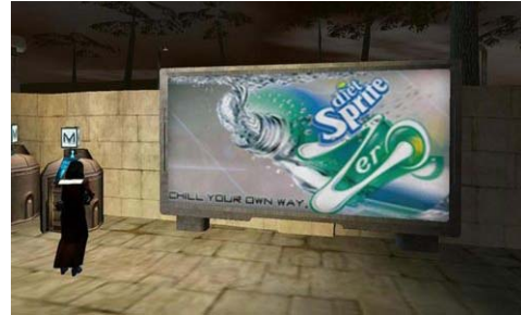
Figure 1: Virtual world video screen

In our work, we are looking at how to adapt the video stream presented in a 3D world in order to reduce the re-