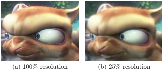
Figure 4: Different quality levels (resolution reduction)

ing the graphics engine to create the 3D environment. Videos are decoded for presentation in the environment using FFmpeg [1]. Decoded videos can be played back on one or more surfaces within the 3D environment (called virtual screens or video surfaces). The user's view of the virtual screen can be changed dynamically as shown in figure 2 as the avatar moves through the online world.