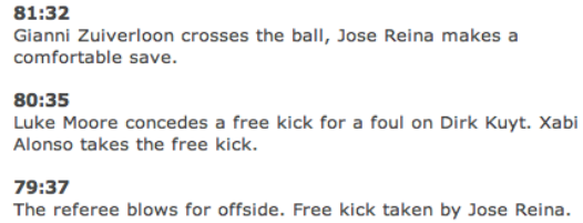
Figure 2: BBC Live Text Commentary snippet [1]